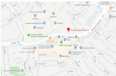
Templars Square, Bus Stop C