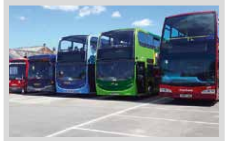
Bus enthusiasts enjoy a sunny day at Mid-Norfolk railway's vintage bus and coach rally.

Konectbus displayed four buses on the day with employees on-hand to supply information and supervise children (and parents!) sitting in the drivers' seats. It was also an opportunity to give out our '20 years of Konectbus' flyer, which included the company history, upcoming news and recruitment information.