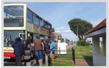
The Hedingham Park & Ride Service helped to reduce congestion during the Clacton Air Show.

As well as operating the local bus network in Clacton-on-Sea, we now provide the Park & Ride service for the town's largest event, The Clacton Airshow.