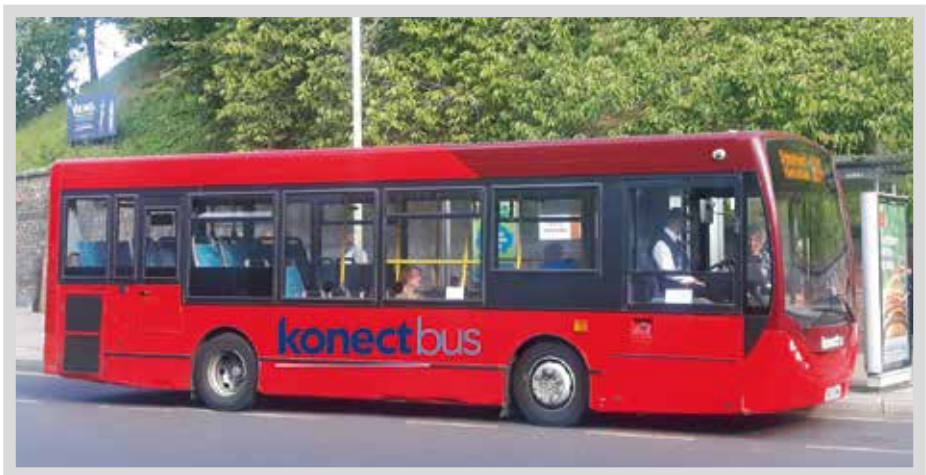
The Euro 5 now operating across Norwich City Centre.

The reduction in losses and wider improvements to business efficiency has led to a decision to invest in brand new vehicles in 2019.